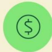
Income Protection Illness Cover