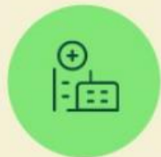
Serious Illness Trauma Cover